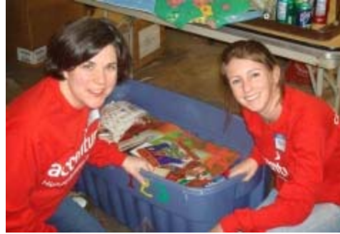
Accenture volunteers organize gifts donated to the shelter.