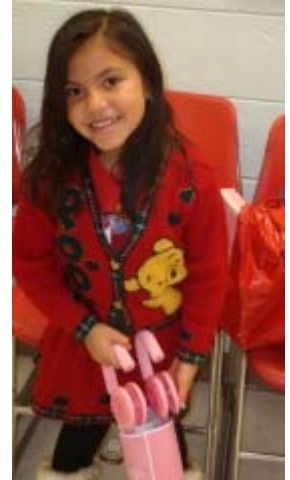
A Carpenter's child shows off a gift from an event with the Alexandria Jaycees.

Please visit http://www.carpentersshelter.org later in January to view our holiday slideshow featuring the season's highlights.